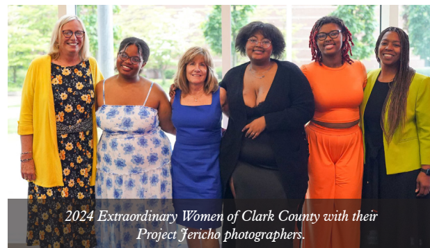
2024 Extraordinary Women of Clark County with their Project Jericho photographers.

But the empowerment doesn't stop with women. The ripple effect of supporting women extends to the entire community, fostering an environment where everyone can benefit from a more equitable society. Our hope is that the 280 luncheon attendees left this event inspired to use their talents to make our community a better place!