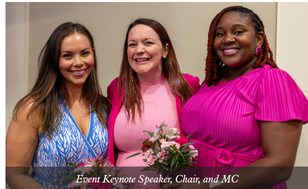
Event Keynote Speaker, Chair, and MC

Empowerment starts with action, and in Clark County, the Women's Partnership Funds (WPF) is leading the charge. As an affiliate of the Springfield Foundation, the WPF addresses women's critical challenges, from domestic violence to economic independence. Our mission isn't just about providing immediate assistance; it's about fostering long-term self-sufficiency and growth. We were thrilled to spend an afternoon celebrating the accomplishments of three women that we firmly believe uphold the mission of WPF.